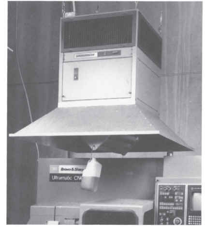
The F62B with optional hood and drain pan for oil mist applications.

This product is not available for resale or installation in California.